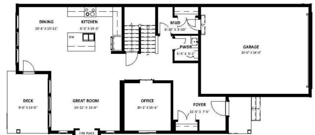
MAIN 1,085 SQ.FT. GARAGE 477 SQ. FT.